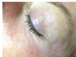
After 1 treatment