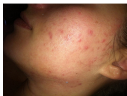
After 3 treatments