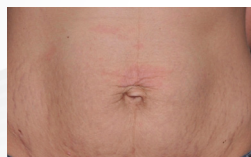
After 4 treatments